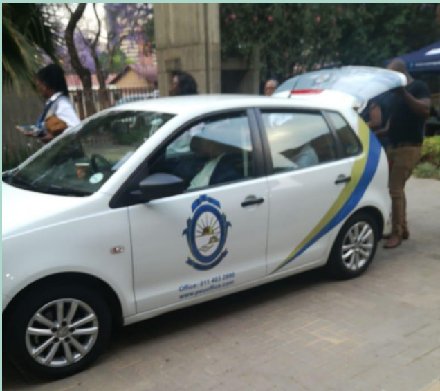
The branded union car.

numbers each day. This is because of the dedication of all our members out there who are always representing the union very well.