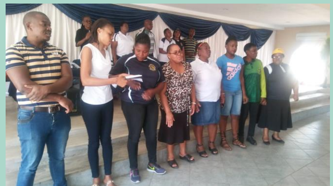
Newly recruited Members from the Lebombo branch during their mass meeting.

We are proud to have taken or being represented by members from the Lowveld at the PEC. From another perspective one may say it puts the district at a great advantage.