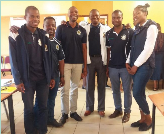
Young executive lions at the PGEC with their president.